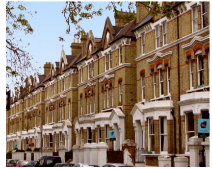
Fig. 3: Houses in a temperate area.

Even though temperate zones account for the smallest area of the Earth out of all the major climate zones, they are by far the most popular areas in which to live. Around four out of every ten people live in a temperate area. This is largely due to the mildness of the climate, which means it is not too hot, cold or wet. There is still usually enough rain for people and animals to drink and for lots of plants to grow. Soil is also generally very fertile, which means that it is good for growing crops in.