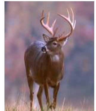
Fig. 5: A deer

Temperate climates support a wide range of plants and animals. Deciduous trees, such as the oak and the beech, are the most common types of tree found in the temperate zones. The leaves of trees make food for the tree by using sunshine, in a process called photosynthesis. Deciduous trees are trees that lose their leaves in winter because there is much less sunshine than in summer, and so the leaves are no use. Most of the temperate zone, including Britain, was covered with forests before people cleared a lot of them to make space for farms. Animals that live in deciduous forests include deer, squirrels and hedgehogs.