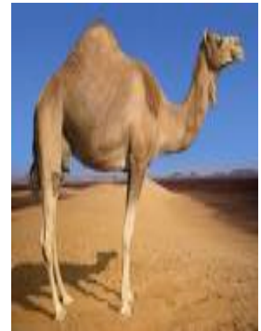
Fig. 6: Camel

Animals such as insects, camels, lizards, snakes, and cougars live in deserts. Similarly to plants that live in the desert they have special adaptations. The sidewinder snake has a distinctive side-winding movement to ensure that not all of its body is touching the burning sand at any one time. A camel can store great amounts of water to sustain it for long periods without drinking. The camel also has the capacity to foam at the mouth when it overheats, just like we sweat. The foam spreads over parts of the animal's body and then evaporates in the sun, so reducing its temperature.