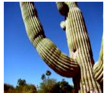
Fig. 4: Cactus

There are some plants in the desert. Indeed a common misunderstanding people have about deserts is that they are barren and lifeless; however several kinds of plants and animals are able to live in the desert. The plants that do survive have special adaptations. For example, the cactus has a tough outer skin to resist the heat and is able to store large amounts of water on the rare occasions when rain falls. Some seeds can survive for long periods, months or even years, waiting for rain. When rain does eventually fall they mature and bloom very quickly and shed more seeds, which in turn, will lie in wait for the next rains.