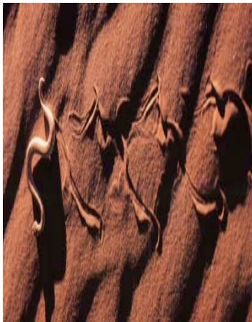
Fig. 5: Sidewinder snake

Animals such as insects, camels, lizards, snakes, and cougars live in deserts. Similarly to plants that live in the desert they have special adaptations. The sidewinder snake has a distinctive side-winding movement to ensure that not all of its body is touching the burning sand at any one time. A camel can store great amounts of water to sustain it for long periods without drinking. The camel also has the capacity to foam at the mouth when it overheats, just like we sweat. The foam spreads over parts of the animal's body and then evaporates in the sun, so reducing its temperature.