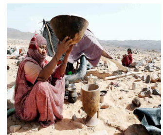
Fig. 3: Tuareg people

The harsh climate makes life difficult for people. Life is difficult because the lack of water and rain means there is little water to drink or to use to grow crops. Many desert tribes such as the Australian Aborigines and the Tuareg of North Africa have survived as nomads. Nomads wander around from one area to the next looking for food, never staying for too long in one place because there is so little to eat, even in a large area.