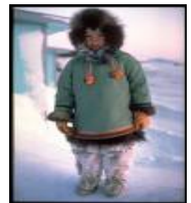
Fig. 3: An Eskimo

The Polar Regions are found near the North Pole and South Pole, between 60^{\circ} and 90^{\circ} latitude. The area that surrounds the South Pole is known as Antarctica, while the area that surrounds the North Pole is the Arctic Circle. The Antarctic is a landmass (a continent in its own right) but one that is buried in ice, sometimes miles deep. It is the coldest place on Earth. The Arctic is slightly warmer than Antarctica, but unlike Antarctica it has no land. Instead the Arctic is a sea of ice, most of which never melts. Greenland, North America and Siberia (in Northern Russia) are the nearest concrete land to the Arctic. On the map the polar areas are white or purple.