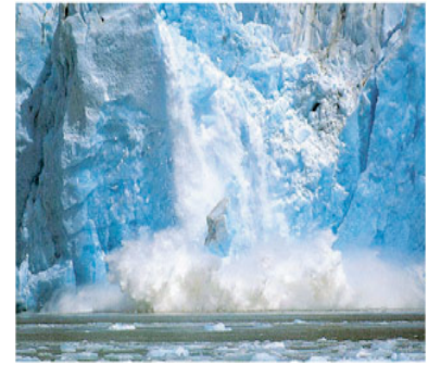
Fig. 4: A melting glacier

Although very few people live in the Polar Regions, people still have a huge impact on them. Global warming caused by polluting gases, such as methane from cattle and carbon dioxide from burning fossil fuels like coal, oil and gas is causing the overall average global temperature to rise. The higher temperatures melt glaciers (huge bits of ice), which raises sea levels and thus increases flooding. The melting of ice also destroys the habitat of animals like the polar bear. An animal's habitat is the name for the place where it lives.