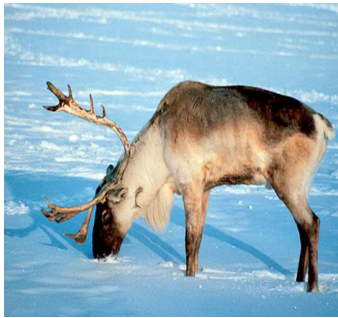
Fig. 5: A Caribou

Unsurprisingly not many animals have chosen to make the Polar Regions their home. In Antarctica one animal that does survive is the emperor penguin, which keeps its eggs warm by holding them between its feet and covering them with a flap of fur. In the Arctic the summer brings a brief flourishing of small shrubs and plants, and in comparison to the Antarctic, wildlife is plentiful. Caribou take advantage of the plants that grow in the brief spring and summer. Animals such as polar bears and the beautiful arctic fox also seem to thrive in the conditions, while migrating birds pay visits in summer to feed on the plant life.