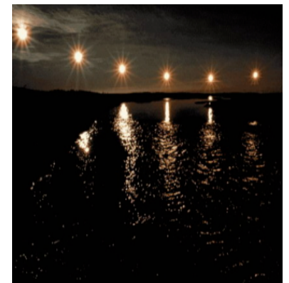
Fig. 6: The sun moving through the sky during an Arctic summer

Polar areas do not have four clear seasons of equal length like we do in Britain. Both the North Pole and the South Pole have long dark winters with no sun at all, and long summers when they are transformed in the 'Land of the Midnight Sun' and the sun never sets! The Polar Regions remain relatively cold all year round, even in summer. However, there are some places in the polar zones where the snow and ice melts during the warmest part of the year. The northern coasts of Canada and Alaska and the southern tip of South America are examples of these places.