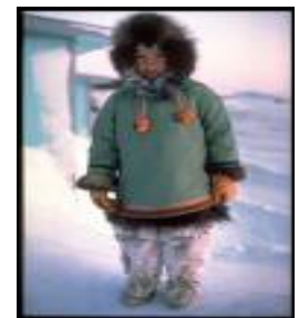
Fig. 3: An Eskimo

Surprisingly despite the extreme conditions some people have made their homes in polar areas. The traditional inhabitants of the Arctic region are the Eskimos, or Inuit, who have survived by adapting to their harsh environment. Modern technology and clothing has made life somewhat easier for them. In contrast, apart from scientists in lonely research stations, no humans live in Antarctica. The challenge posed by the harsh environment has inspired explorers. One such group of explorers who died in 1912 trying to get to the South Pole was Captain Scott and his companions.